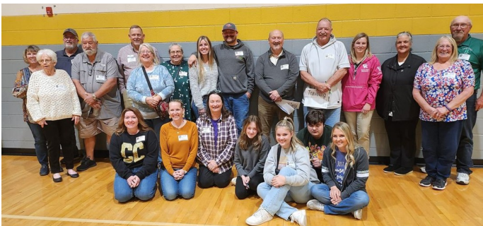
It's Reality Volunteers

Extension agents also do a lot of volunteering for our community. First Friday, Back to School Bash, Harry Potter Halloween, Winter Wonderland, are some that we have done since September this year.