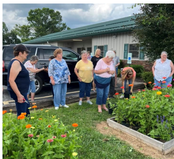
Participants Planted in Raised Beds

The 2023 National Gardening Survey is the comprehensive market research report that leaders in the lawn and garden industry count on each year to track the market and help them make strategic decisions. Conducted annually since 1973, the Survey provides in-depth and up-to-date marketing information on industry trends, household participation, consumer profiles, gardeners' attitudes, and retail sales. The National Gardening Survey provides insights into American household lawn and garden activities and spending for the year 2022, as well as expectations for 2023. Participation in lawn and gardening activities remained high in 2022, with a 5-year high of 80% of households taking part. Due to this information, the family and consumer sciences department decided to offer a Sustainable Gardening series with flowers and vegetables.