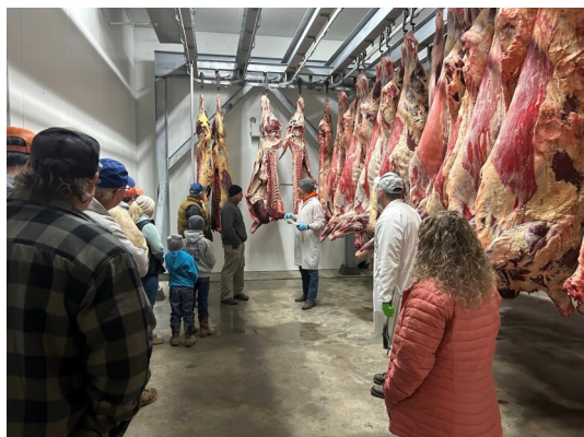
Field to Freezer Program

This year the ANR program area has done a lot of growing! The Riverview Farmers Market has been reestablished and has doubled its membership! This year we plan to keep growing this market as well as continue education for our members and community members.